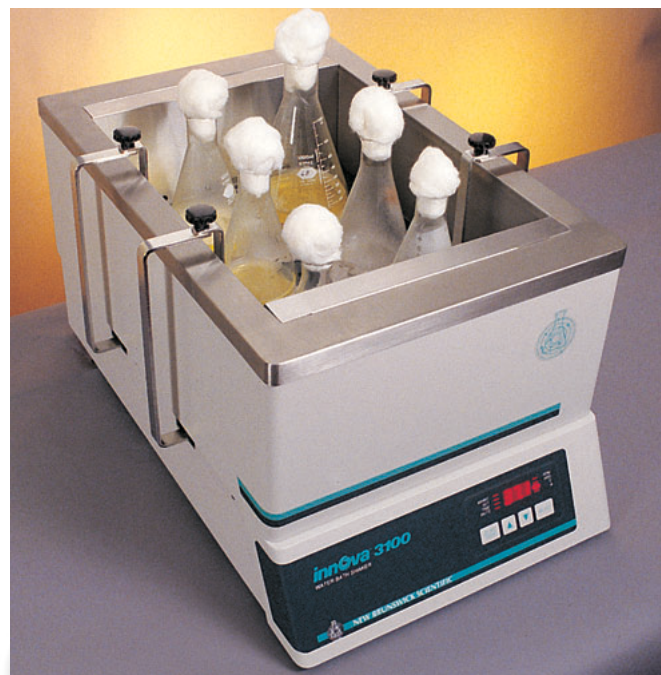
Innova 3100 high-temperature water bath shaker.

Larger-capacity than many water bath shakers, the Innova 3100 easily accommodates gel trays, tubes and flasks.